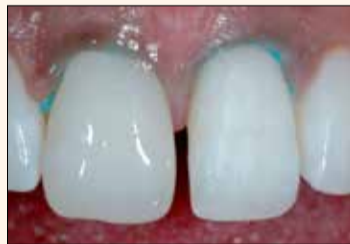
Fig. 19. Tooth #12 after final restoration.