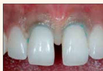
Fig. 9. Teeth #12 and 21 after isolation with gingival retraction cords.