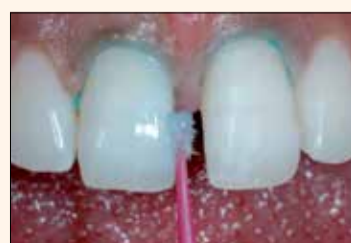
Fig. 11. Enamel etching with phosphoric acid (FL-Bond Etchant) for 20 seconds.