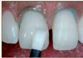
Fig. 17. Dentine layer is smoothed with a brush and light cured.