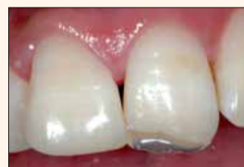
Fig. 6. Plastic strip is removed after light curing; note beautiful lingual frame.