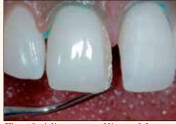
Fig. 15. Adjustment of lingual frame with sharp hand instrument.