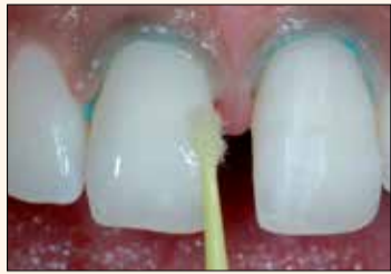
Fig. 12. FL Bond II and not FL Bond.