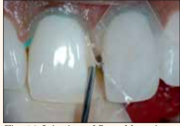
Fig. 14. Injection of flowable resin (Beautiful Flow shade A3T).