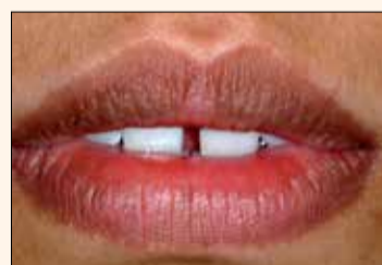
Fig. 7. Lips at rest; note MD is clearly visible.