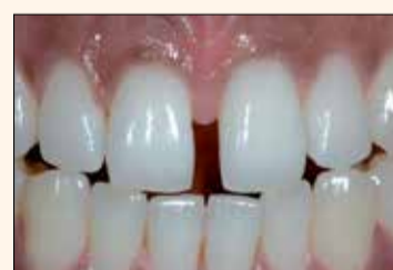
Fig. 8. MD in close-up view.