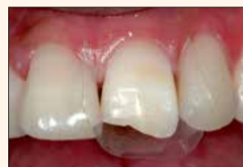
Fig. 2. Placement of plastic strip.

After the interview, the disease, force element and aesthetic defects of her smile were explored