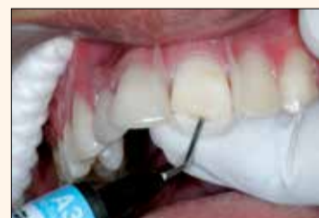
Fig. 4. Injection of flowable resin to create frame.