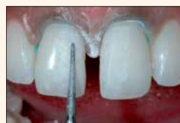
Fig. 10. Light touch upon the enamel surface of tooth #12 with diamond point to enhance bonding process.