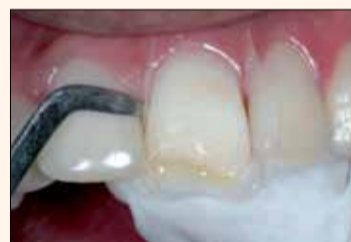
Fig. 5. Flowable resin ready for light curing.