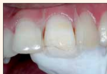
Fig. 3. Plastic strip is supported with index finger.