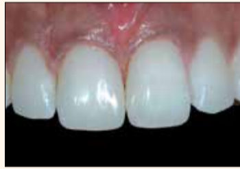
Fig. 21. Teeth #12 and 21 after finishing and polishing.