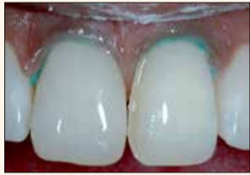
Fig. 20. Lingual frame created on tooth #21.