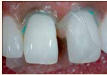
Fig. 13. Placement of plastic strip for FFT.