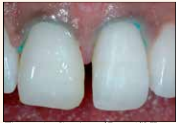
Fig. 16. Application of Beautiful II dentine shade A1.