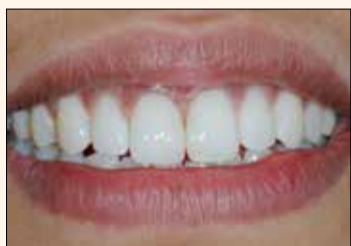
Fig. 22. Final smile.

clinically. Necessary digital photographs were taken, along with diagnostic study models for further exploration of existing diseases, force elements and aesthetic defects. The patient had good oral health, normal function and no para-functional or other destructive oral habits.