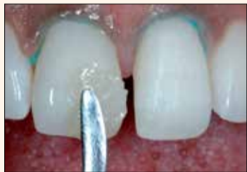
Fig. 18. Application of enamel layer in Beautiful II shade Inc.