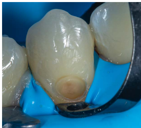
3. Rubber dam placement with B4 wingless clamp.