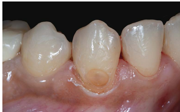
2. Retracted view after caries removal, bevel preparation and crown lengthening of tooth #43 to create a supra gingival margin.