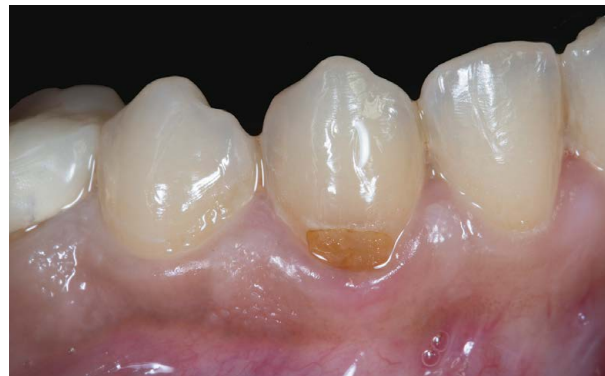
1. Retracted view of Class V Decay on tooth #43.

40 years old lady visited the dental office for sensitivity on eating sweets and cold on lower canine tooth. Clinical examination revealed cervical decay with slight subgingival extension and some irregularities on the tooth. The MiCD treatment approach with the naturomimetic "ONE layering technique" was adopted for this Class V lesion. After caries removal, crown lengthening with electrocautery was done to create a supra gingival margin with the intension to increase longevity of the restoration followed by a direct restoration with bioactive restorative materials (Shofu Beautifil range of composites). The patient was extremely satisfied with the invisible restoration as the restorative material blended well with the natural tooth.