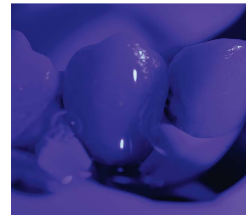
10. Application of Glycerine for the final cure to remove the inhibition layer.