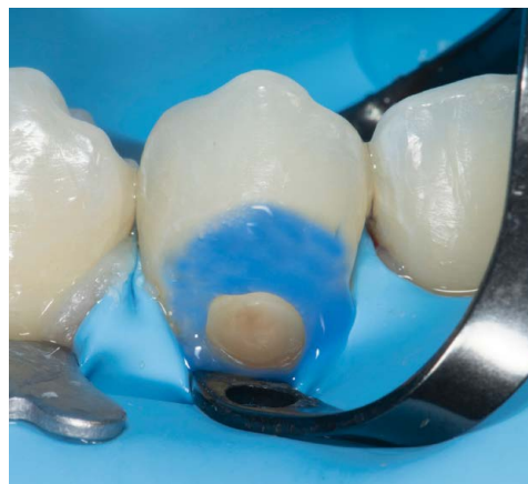
4. Selective etching with slight extension above the preparation for modification of tooth anatomy.