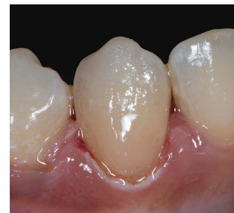
11. After removal of rubber dam for anatomical contouring.