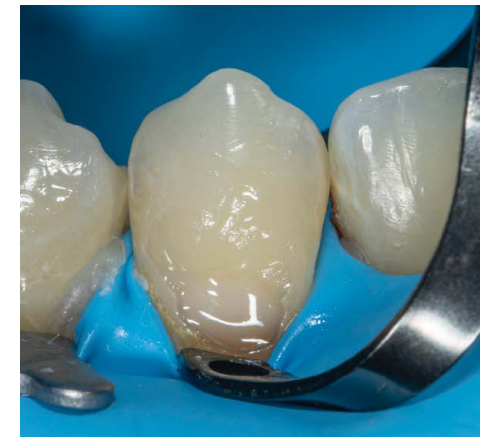
7. Build-up of deep dentin layer with a small quantity of Beautifil Injectable A20 shade and light cured.