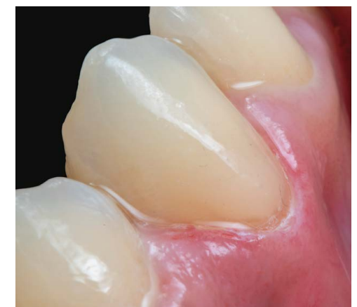
12. Finishing and polishing completed Super-Snap X-Treme disk system. (Black disk for contouring, Purple disk for finishing, Green / Pink disks for polishing and super polishing with Aluminium oxide impregnated Super buff disk.