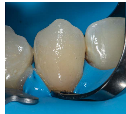
9. Final enamel layer placed with low value translucent Beautifil II shade LVT to achieve the desired brightness.