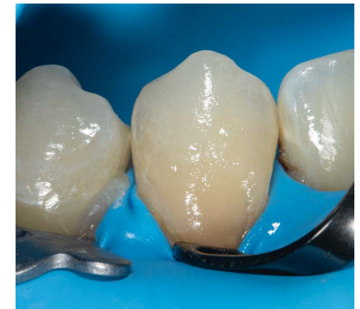
8. Build-up of dentin layer with Beautifil II LS shade A3.5 while maintaining 0.3mm for the enamel layer.