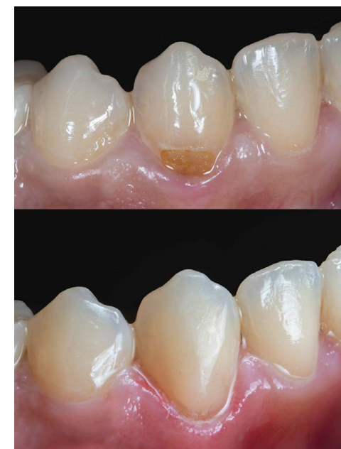
13. Before and After - one-month post-op showcasing life-like aesthetics achieved to mimic the natural tooth.