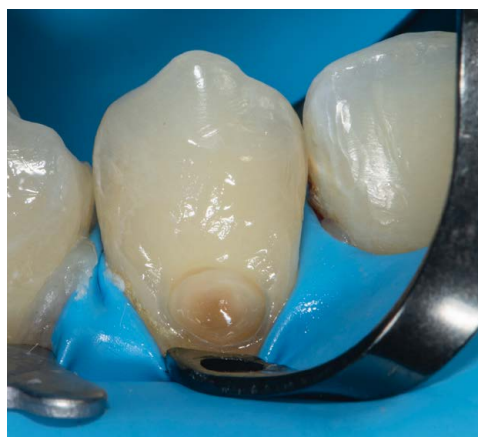
5. Application of 6 th Generation Adhesive system (FL Bond II)